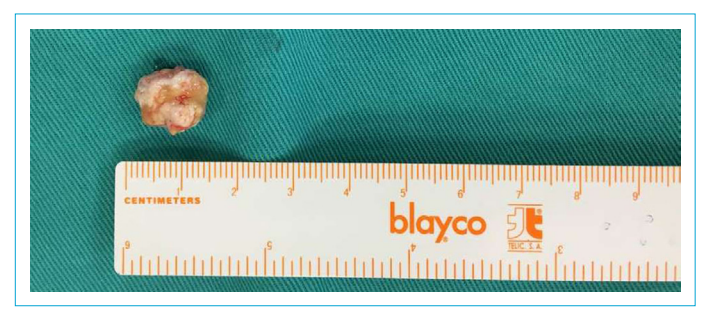
Figure 3. The excised calculus measuring at 15 mm×15 mm.

An open left submandibular gland resection was performed via transcervical approach under general anesthesia to remove both the gland and the sialolith. A direct incision was made along the inferior left mandibular line